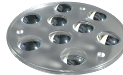
9 B 3570 D