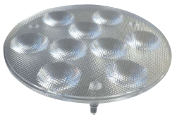
9 B 30 D