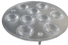
9 B 50 D